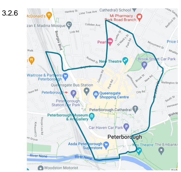
Map 2 - This is a map showing the Peterborough City policing area as published on Police.uk